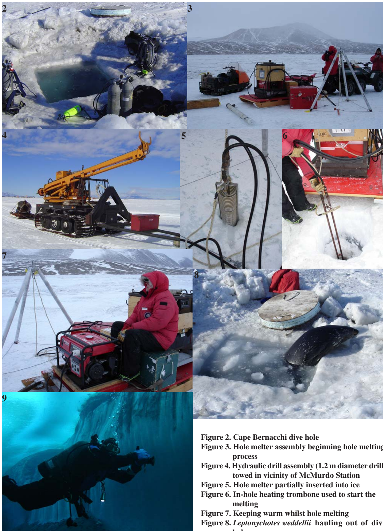
Figure 2. Cape Bernacchi dive hole Figure 3. Hole melter assembly beginning hole melting process Figure 4. Hydraulic drill assembly (1.2 m diameter drill) towed in vicinity of McMurdo Station Figure 5. Hole melter partially inserted into ice Figure 6. In-hole heating trombone used to start the melting Figure 7. Keeping warm whilst hole melting Figure 8. Leptonychotes weddellii hauling out of dive hole Figure 9. Diver beside an ice wall